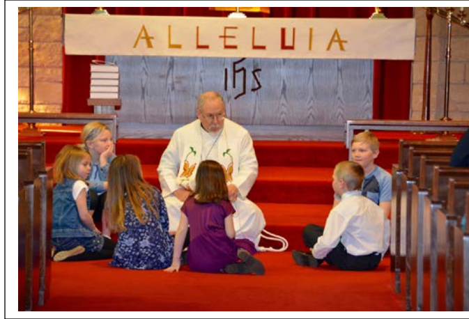
Children's Sermon, April 22, 2018